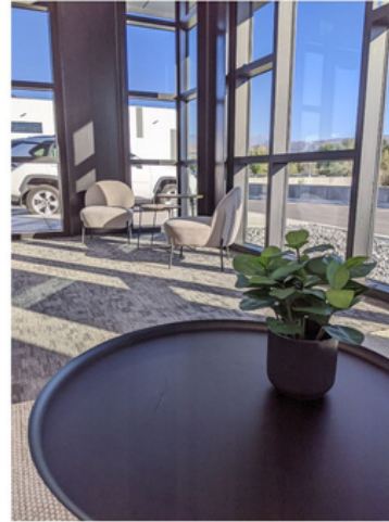
Commercial Space, Draper UT

Form and function combine in this modern, mountain workspace. With a minimal color palette striking design was implemented through selection of artwork, textiles, and simple modern furnishings.