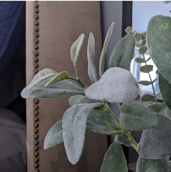
Primary Suite, Sandy UT

Natural tones combine here to create a calming, earthy environment. Luxury linen, ocean tones, and rustic woods invite the couple to relax in this master retreat.