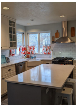
Family Farmhouse, Sandy UT

A farmhouse approach on an outdated family gathering space. Cool tones in white, gray, and blue keep the space feeling modern. The fireplace becomes a focal point with eye-stopping shiplap drawing the eye to the raised ceilings.